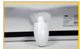
The adjustable stand allows users to position the monitor to best suit their needs