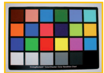
Colors are produced close to original but are a tad bright

SPECIFICATIONS DRIVING SYSTEM TFT Color LCD ASPECT RATIO 16:9 CONNECTIONS 1 x 24-pin DVI-D, 1 x 15-pin D-SUB BRIGHTNESS 250 cd/m 2 FEATURES Full HD, Solid Panel, Real Color, True Wide, In Plane Switching, Auto Off Timer DIMENSIONS 609 x 446 x 140 mm WEIGHT 5kg CONTACT Passco Technology Sdn Bhd / Pure-Link Technology (M) Sdn Bhd TELEPHONE (07) 433 3301, (07) 554 2041 / (03) 3348 8889 URL www.aocmonitorap.com/malaysia